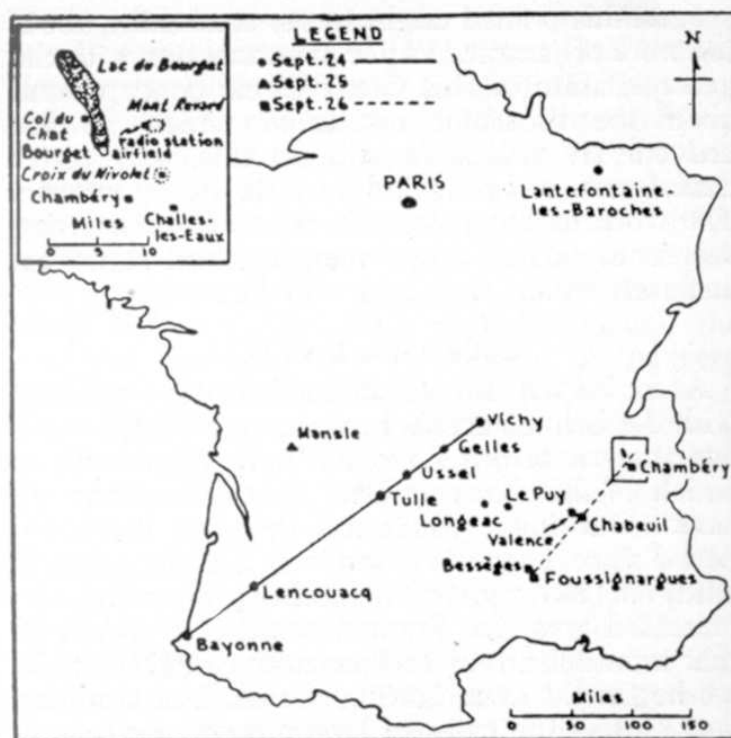
MAP 5 Sightings and Alignments, September 24, 25, 26

In conclusion, I would like to emphasise two facts. The first is that Orthoteny, which was merely a theory, has now become at the same time both a research method and a fact. A fact, for it can no longer be doubted that the observation of our planet by the extra-terrestrials is organised, at least in part, on terrestrial Great Circles. And a method, for we are beginning to interpret the meaning of this organisation and to conceive the possibility of forecasting future